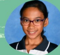
Sofia Lower school