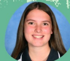
Georgie Sustainability Portfolio