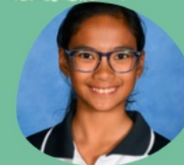
Clare Lower school