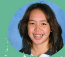
Megan Sustainability Portfolio